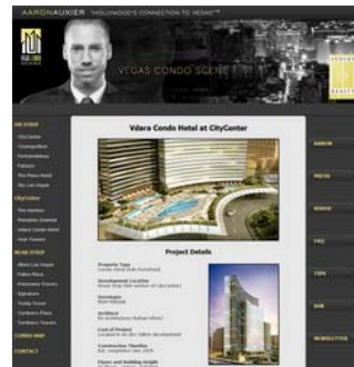
VegasCondoScene focuses on protecting celebrities and athletes.

Bookmark - Del.icio.us | Digg | Furl.it | Spurl | RawSugar | Simpfy | Shadows | Blink.it | My Web